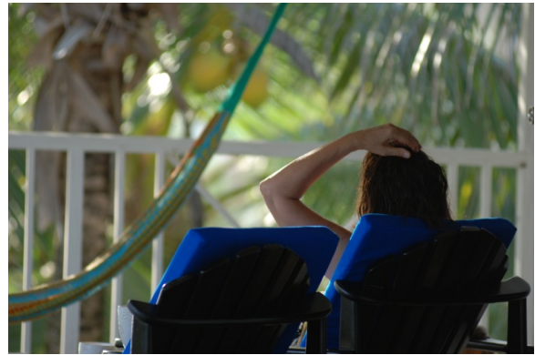
Time to relax