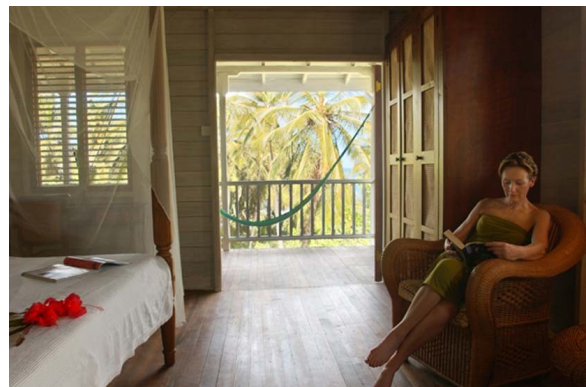
Romantic Atmosphere Cottage

Top Floor: 2 spacious suites. High ceilings, dark wooden floors, classic and contemporary tropical furniture. One unit contains a spacious bedroom, an adjoined study and a bathroom with shower. The other is a large one-bedroom apartment with kitchen and Jacuzzi bath tub.