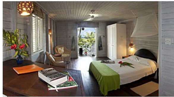
Studio with Sitting Area

Ground level: 4 studios, 3 with queen and one with a four-poster king bed. All rooms with ceiling fans and private bath. A kitchenette invites you to prepare a cold meal or snack.