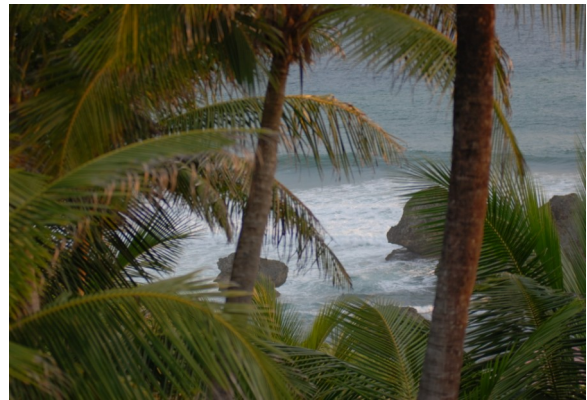
Listen to the waves