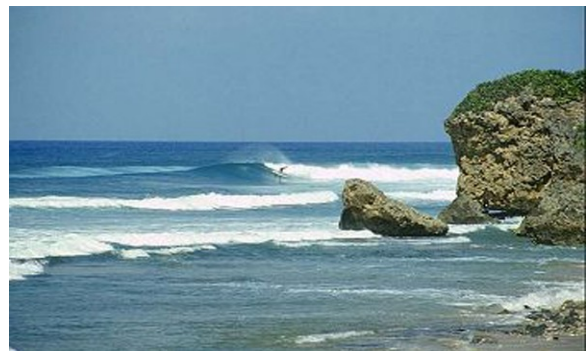
Excellent Surfing at Soup Bowl