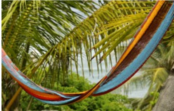
Lush Garden with hammocks