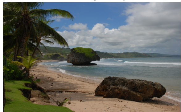
Unspoiled beach in Bathsheba